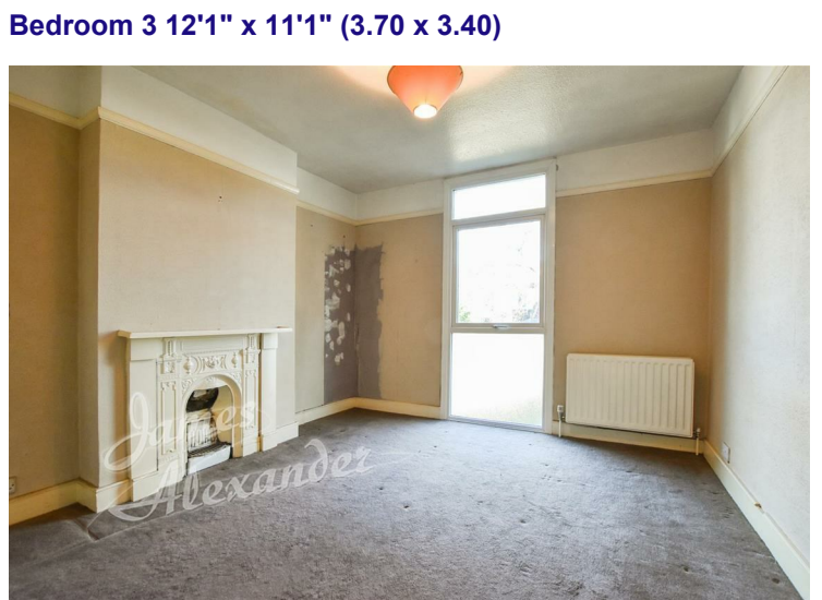
Bedroom 3 12'1" x 11'1" (3.70 x 3.40)